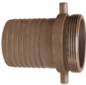
3" - 6" male