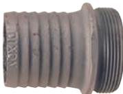
1" - 2½" male